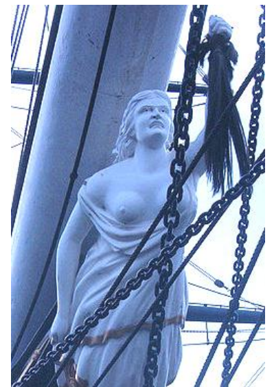
Figurehead of the Cutty Sark