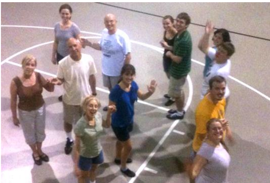
Bottom: Dancers wave to the camera from the balcony at Broadmoor P.C. as they walk through a ceilidh dance.